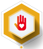
Volunteer Time Off

This is not a full list of benefits for all SEKISUI Diagnostics positions/locations. Benefits will vary by country.