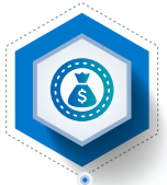
Annual Bonus Program